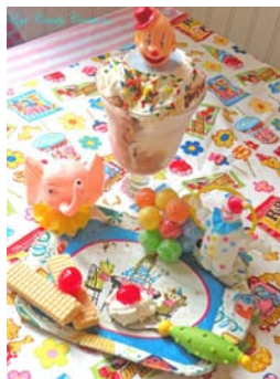
Summer Reading Kick Off and Ice Cream Social

Family Program – all ages are invited Wednesday, June 30 7:00-8:30 p.m.